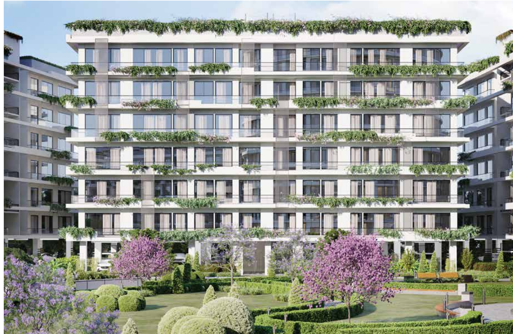
MIDCITY PEARLS (Standard Living, Medium-Rises)

MIDCITY Apartment District is serviced with 60-foot wide “Avenue Sunrise”, “Avenue North” and “Avenue Sunset”. Apartment buildings are designed to provide privacy and serenity to its residents while still allowing them to enjoy welcoming mornings and relaxing evenings. MIDCITY Apartments offer a lifestyle that is beyond concrete walls, providing ample outdoor activities and entertainment facilities.