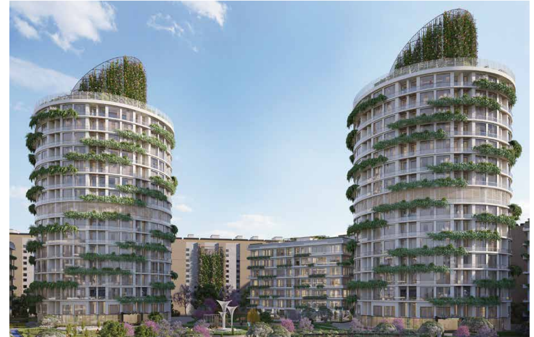
MIDCITY PRESTIGE (Up Style Living, High Rises)