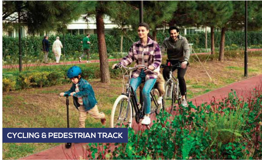
CYCLING & PEDESTRIAN TRACK