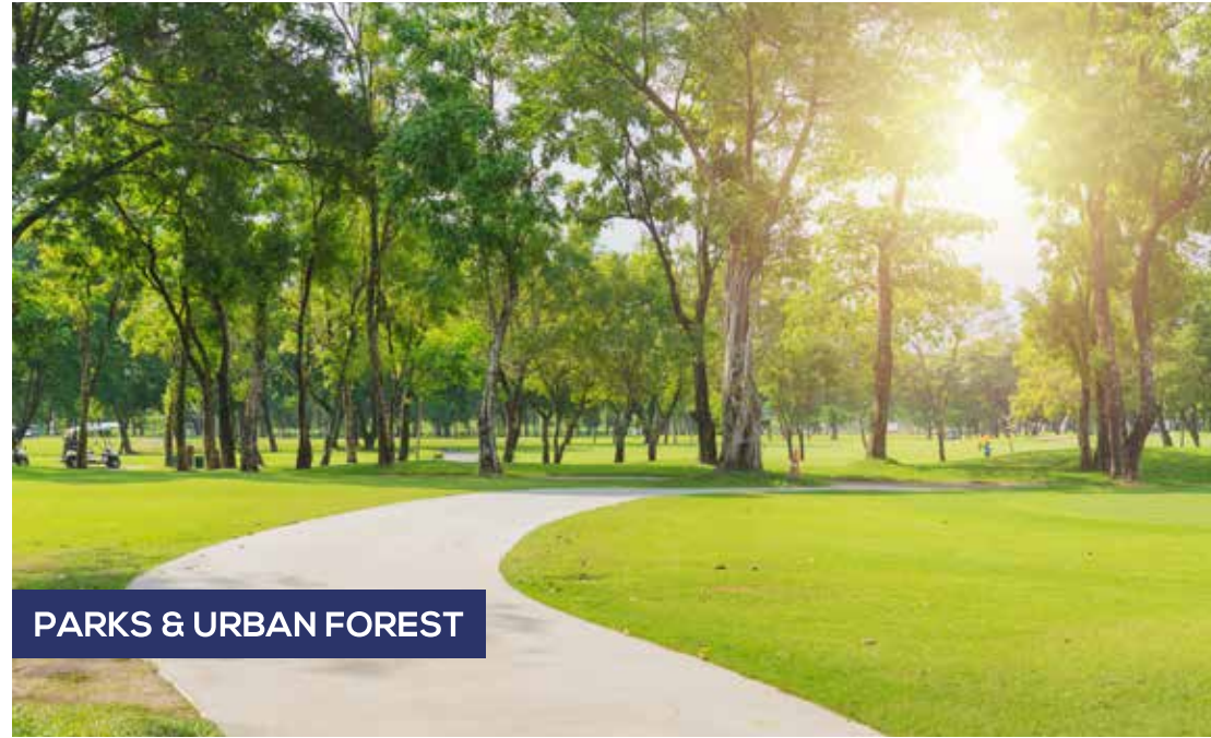
PARKS & URBAN FOREST