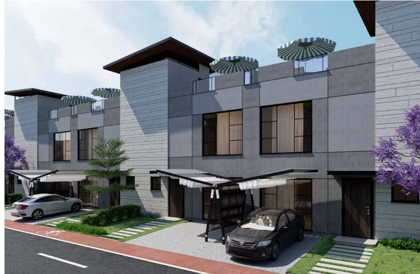
MIDCITY TOWN HOMES

Green Spine, Cul-de-Sacs, Private Street Design, Walking and Cycling Safe Passages create perfect place to be called as “home place.” Complete sense of community grows naturally at MIDCITY, with exclusive attached homes, detached homes, bungalows, Private Villas and multifamily homes hallmarked by families who embrace refined natural living in a uniquely modern setting.