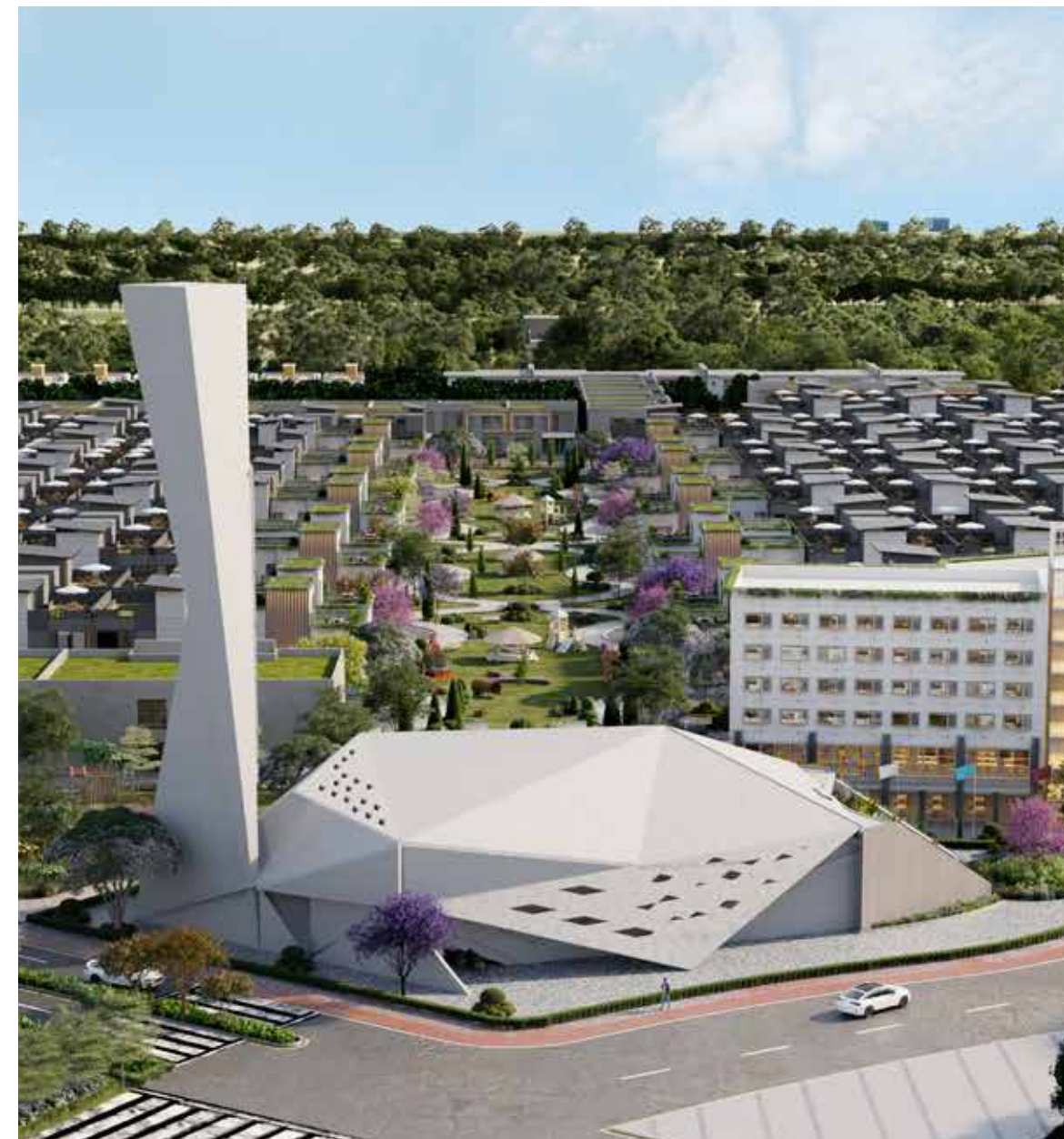
Town House District