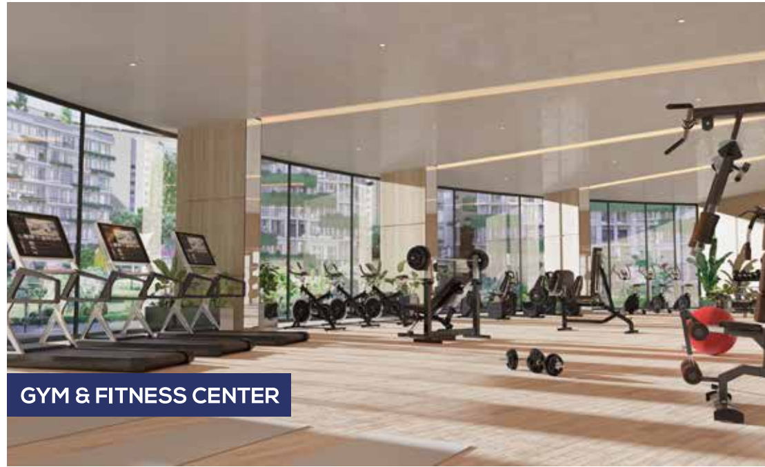
GYM & FITNESS CENTER